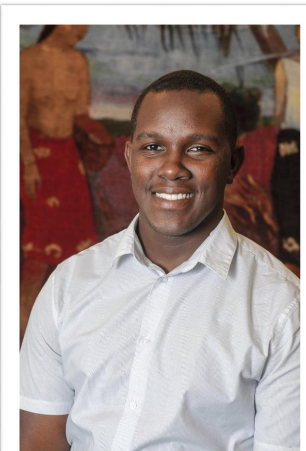
PERSONAL COAT OF ARMS